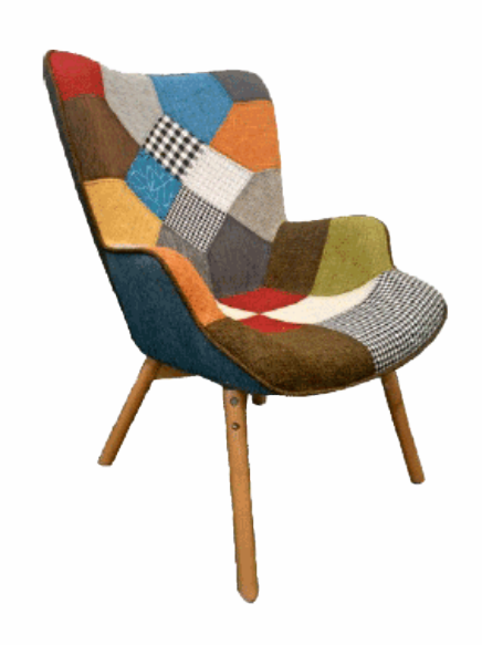
Fabric of RS 300per MTR considered All Items